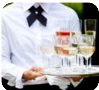
Food & Beverage Management