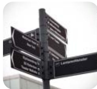
Signages and Productions