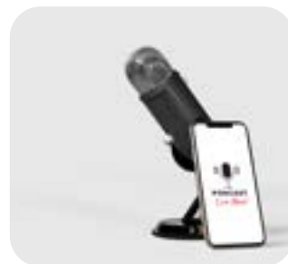
Audio & Visual Management