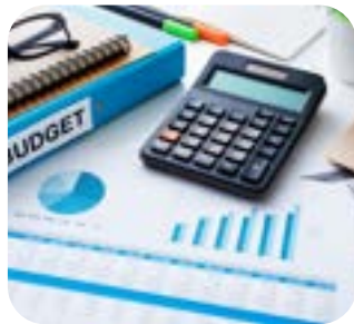
Planning and Budgeting