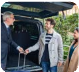
Transfers and Sightseeing