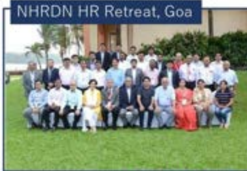
NHRDN HR Retreat, Goa