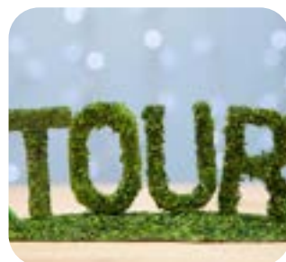
Pre & Post Tours.