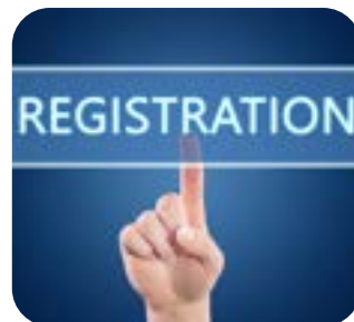
Registrations (Online and Onsite)